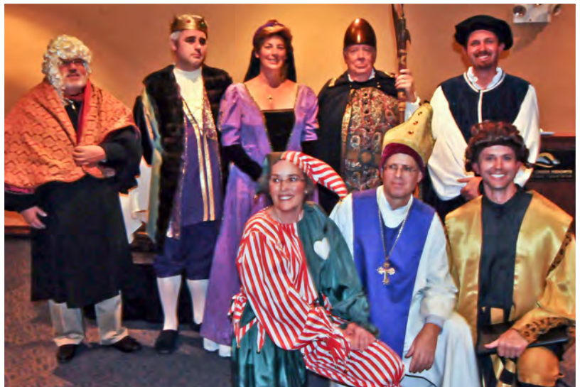
The cast of "The Travails of Henry VIII"