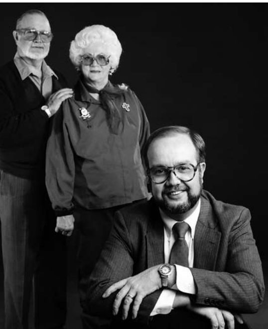
Muskegon Chronicle, 1988

One Book One Firm Selection Rings True for Partner